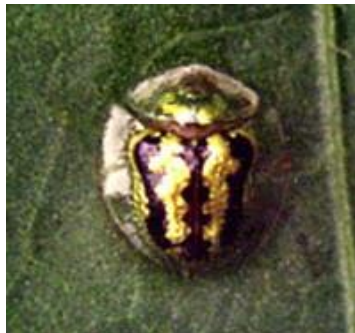
Green Tortoise beetle