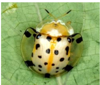
Tortoise shell beetle