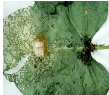
Shell & Damage