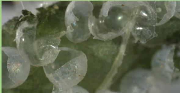
Clockwise from bottom left: The result of a chewing predator feeding on BMSB eggs. A wheel bug adult eats a late-stage nymph in the lab. A marked BMSB nymph was eaten by a damsel bug adult on a sorghum plant during a field experiment.